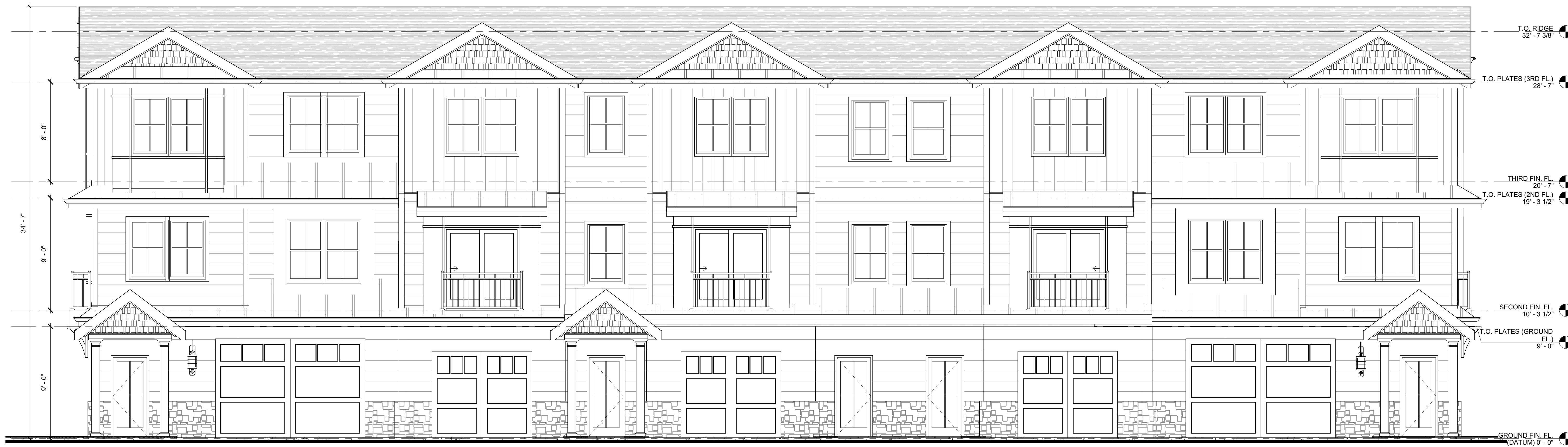
1 BUILDING 2 - FRONT ELEVATION SCALE: 1/4" = 1'-0"

FOR TYPICAL NOTES AND INFORMATION SEE ELEVATION 1 / A-110