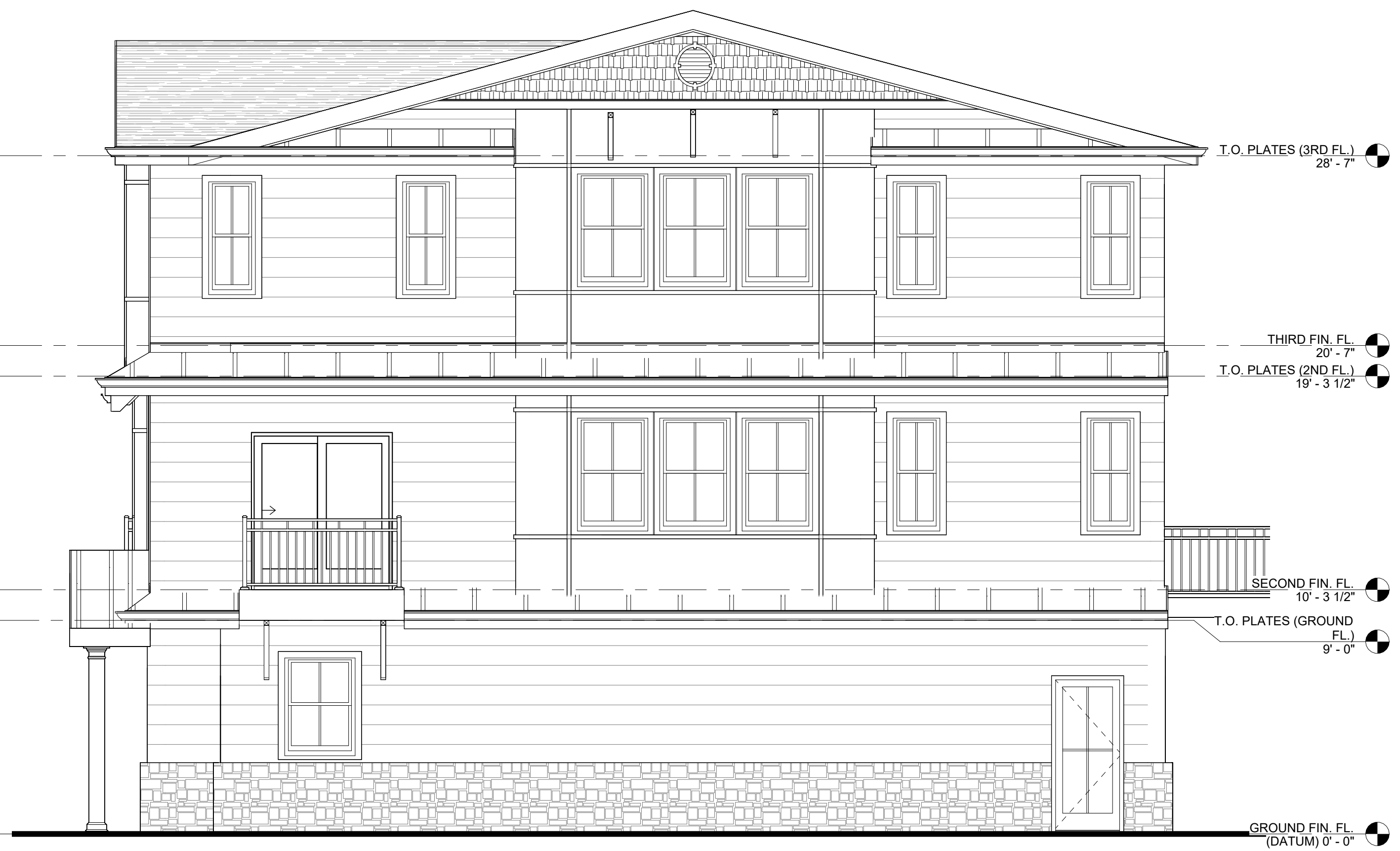
2 BUILDING 3 - SIDE ELEVATION SCALE: 1/4" = 1'-0"

FOR TYPICAL NOTES AND INFORMATION SEE ELEVATION 1 / A-110