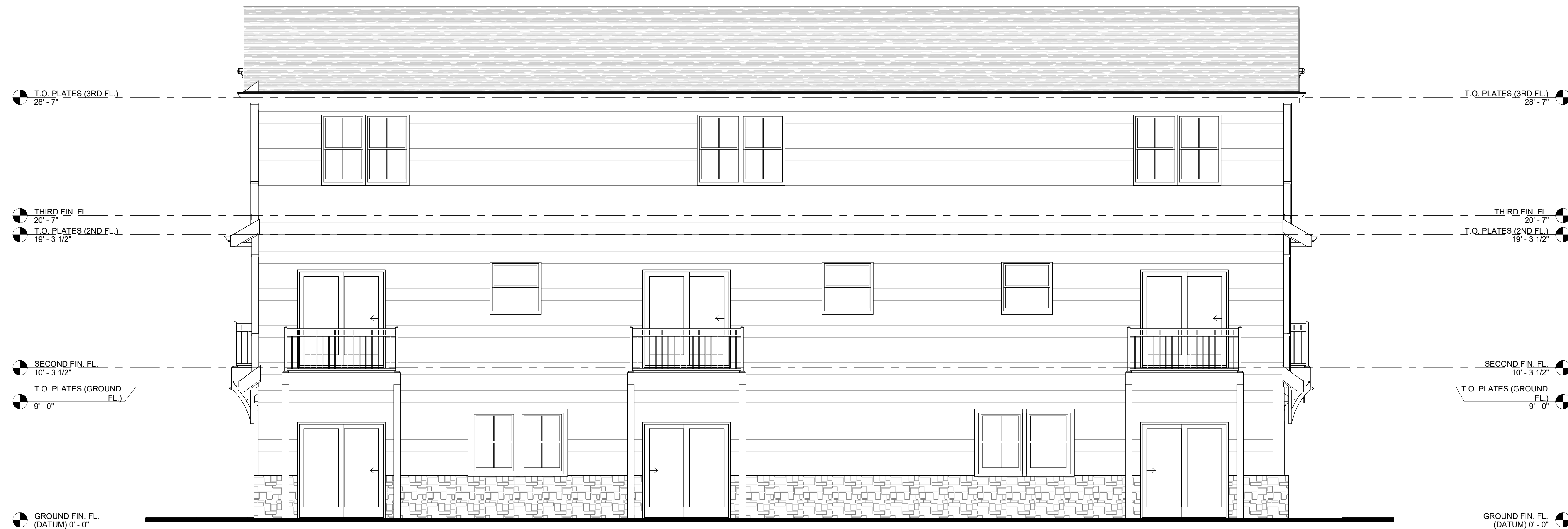
2 BUILDING 3 - REAR ELEVATION SCALE: 1/4" = 1'-0"

FOR TYPICAL NOTES AND INFORMATION SEE ELEVATION 1 / A-110