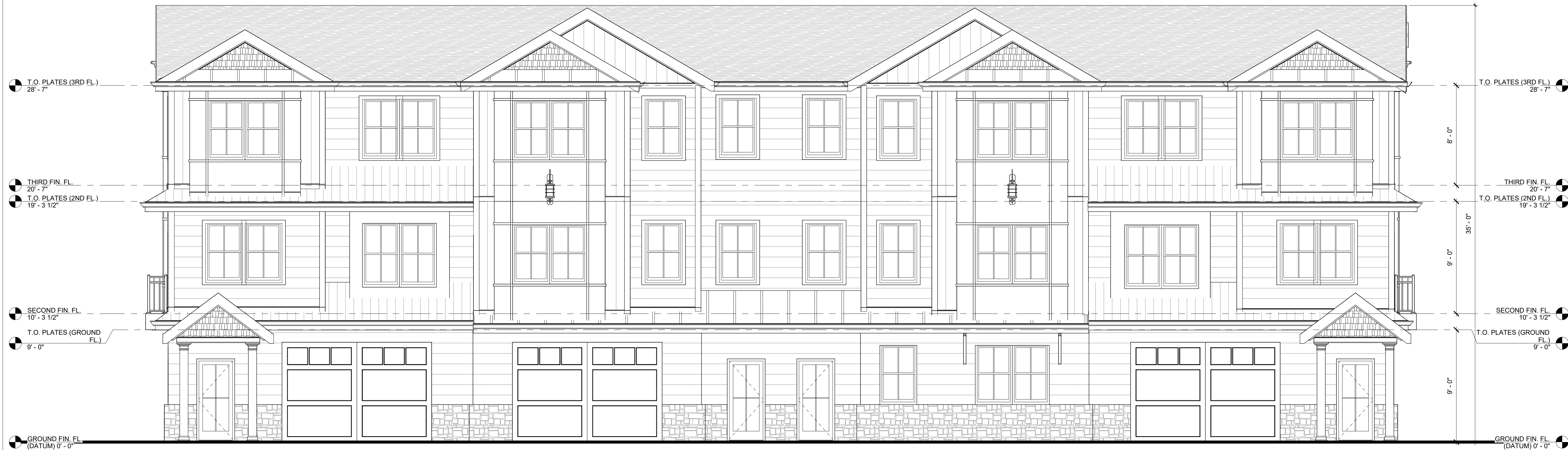
1 BUILDING 4 - FRONT ELEVATION SCALE: 1/4" = 1'-0"

FOR TYPICAL NOTES AND INFORMATION SEE ELEVATION 1 / A-110