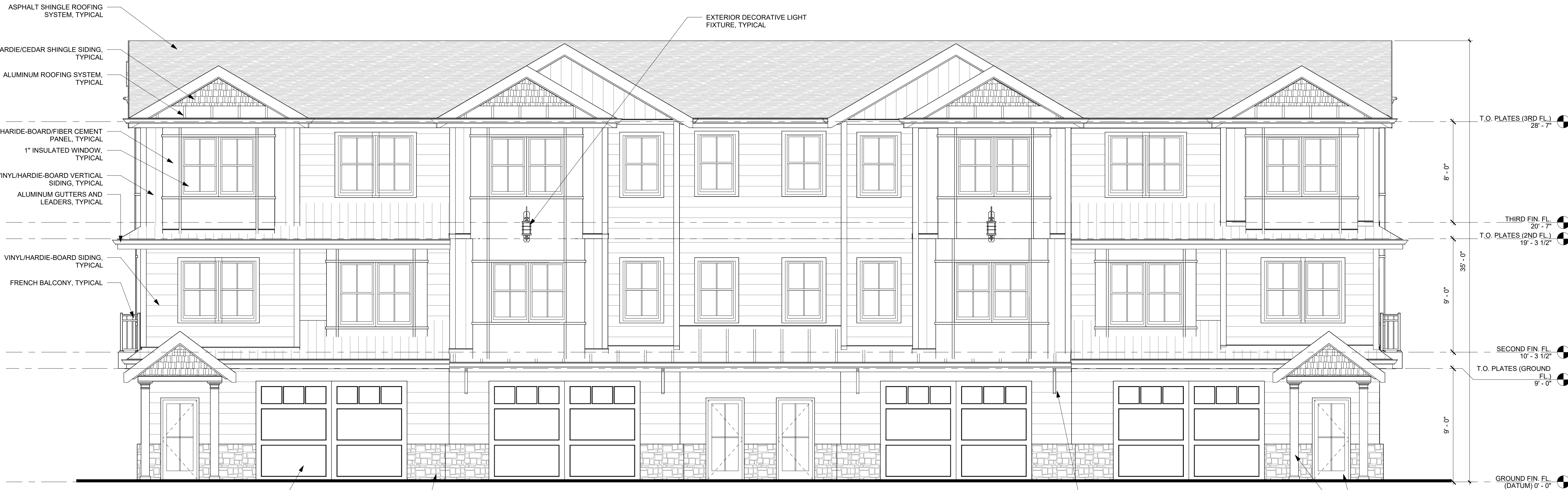
1 BUILDING 1 - FRONT ELEVATION SCALE: 1/4" = 1'-0"

FOR TYPICAL NOTES AND INFORMATION SEE ELEVATION 1 / A-110