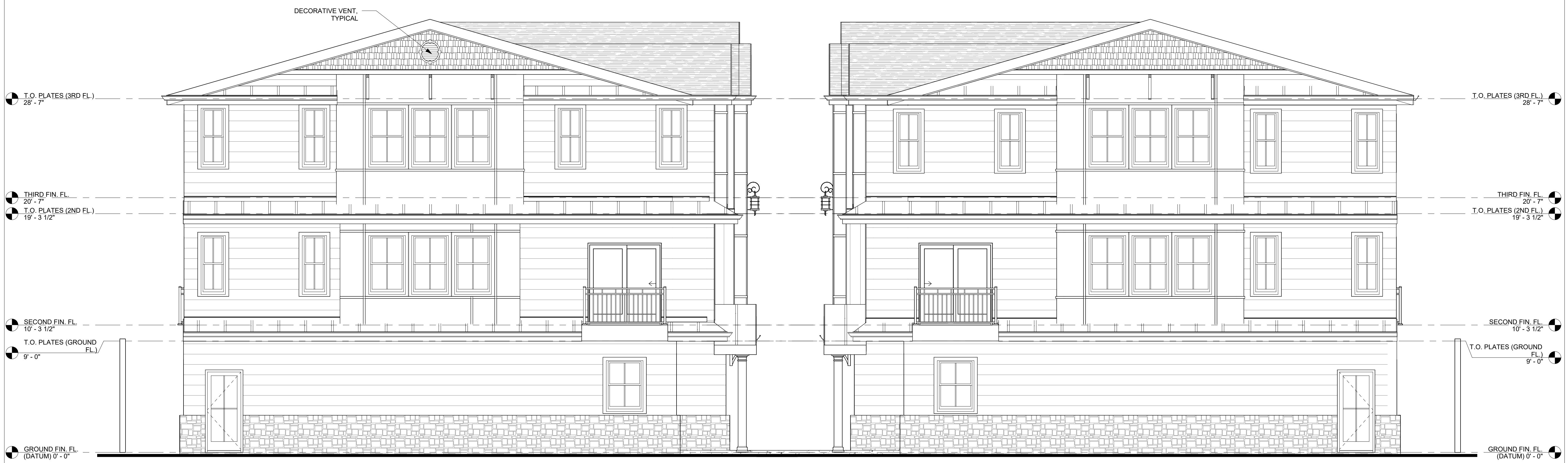
1 BUILDING 1 - SIDE ELEVATION SCALE: 1/4" = 1'-0"

THESE DRAWINGS AND PARTS THEREOF ARE THE EXCLUSIVE PROPERTY OF DANTASCARRETE architecture, llc. THIS DOCUMENT AND THE INFORMATION THAT IT CONTAINS MAY NOT BE REPRODUCED OR USED FOR ANY OTHER PROJECT OTHER THAN THE SPECIFIC PROJECT FOR WHICH IS WAS PREPARED. THESE DRAWINGS CANNOT BE REPRODUCED WITHOUT THE EXPRESSED WRITTEN PERMISSION FROM DANTASCARRETE architecture, llc.