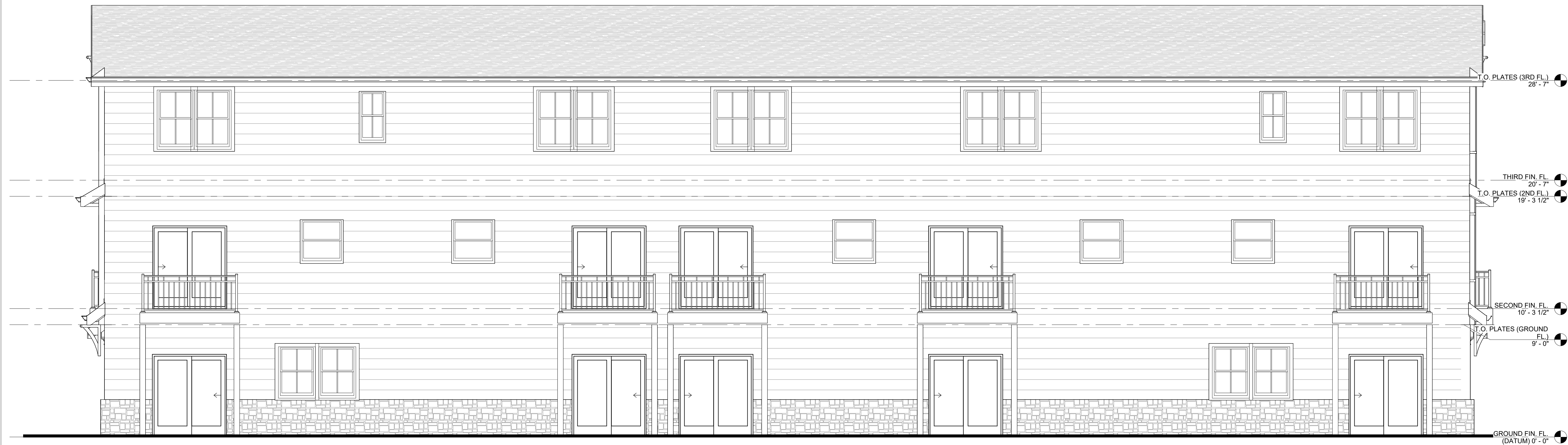
2 BUILDING 2 - REAR ELEVATION SCALE: 1/4" = 1'-0"

FOR TYPICAL NOTES AND INFORMATION SEE ELEVATION 1 / A-110