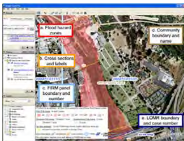
Figure 2. Results after “flying to” an address in Santa Cruz, California. The flood hazard information includes (a) flood hazard zones, (b) cross sections, (c) FIRM panels, (d) communities, and (e) LOMRs.

If flood hazard information is available the map displays: